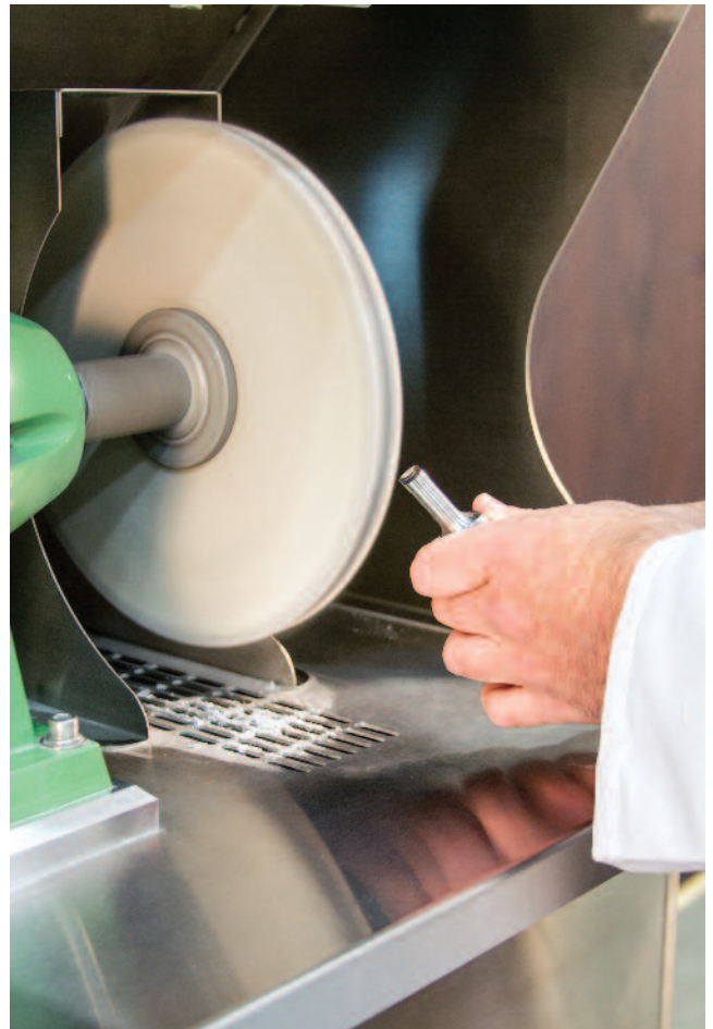
To remove a j-hook, lightly polish the surface of the punch cup and then buff it using a white rouge polish.

Die-bore wear is a normal result of compressing powders in and ejecting tablets from the die. Abrasive powders, such as those used in some dietary supplements, exacerbate the wear. While you cannot eliminate die-bore wear, you can drastically reduce it by using complementary steel types, tapering the die bore, and/or lining the die with a carbide