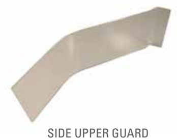
TG-5 | OEM: 36565