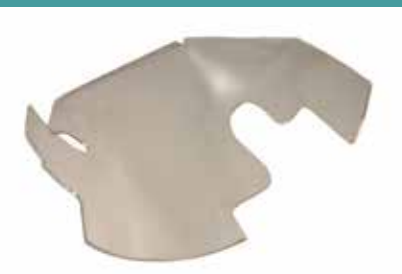
FRONT UPPER GUARD TG-3 | OEM: 36563