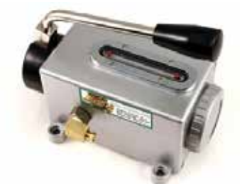
ONE SHOT OIL PUMP (P-28) M-55 | OEM: 93955