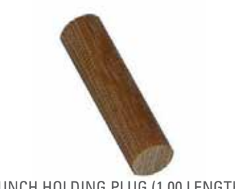
PUNCH HOLDING PLUG (1.00 LENGTH) CB-1 | OEM: PD-35