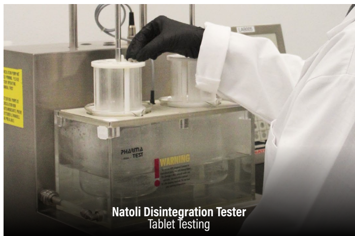
Natoli Disintegration Tester Tablet Testing