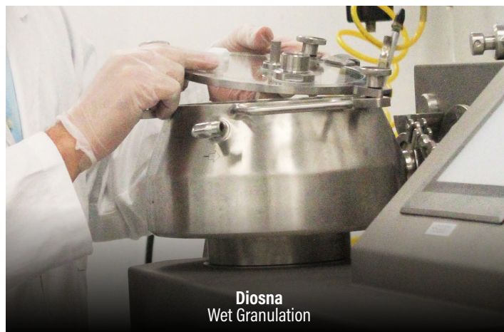
Diosna Wet Granulation

A training course that engages all the elements required for tableting and leverages it with Regulatory Compliance USP <1062> Data. What's your compaction problem?