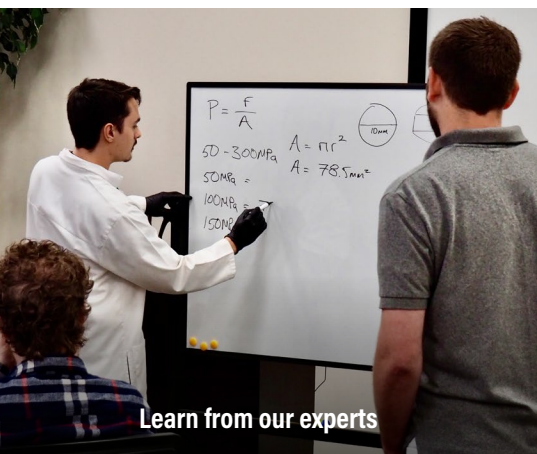
Learn from our experts