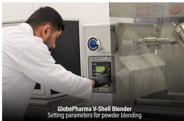
GlobePharma V-Shell Blender Setting parameters for powder blending