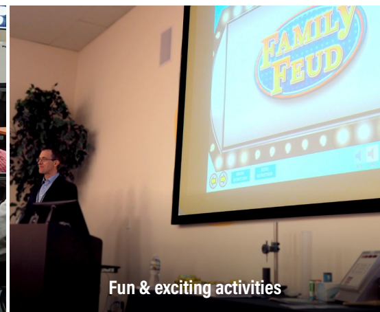
Fun & exciting activities