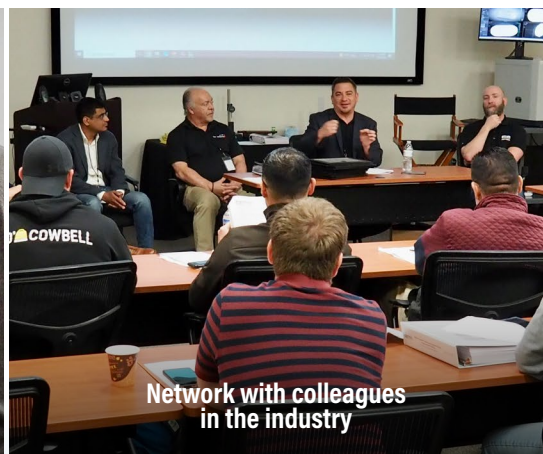
Network with colleagues in the industry