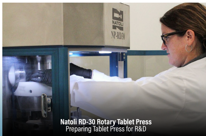
Natoli RD-30 Rotary Tablet Press Preparing Tablet Press for R&D